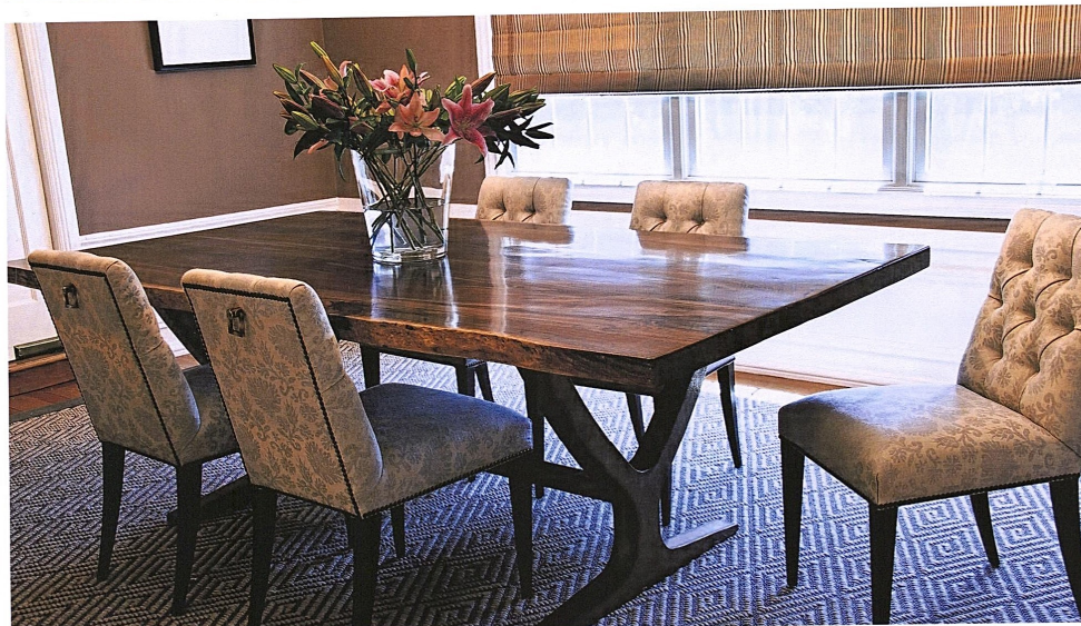
Wood-framed furniture and a custom table decorate the dining room of the home in Crocker Highlands.