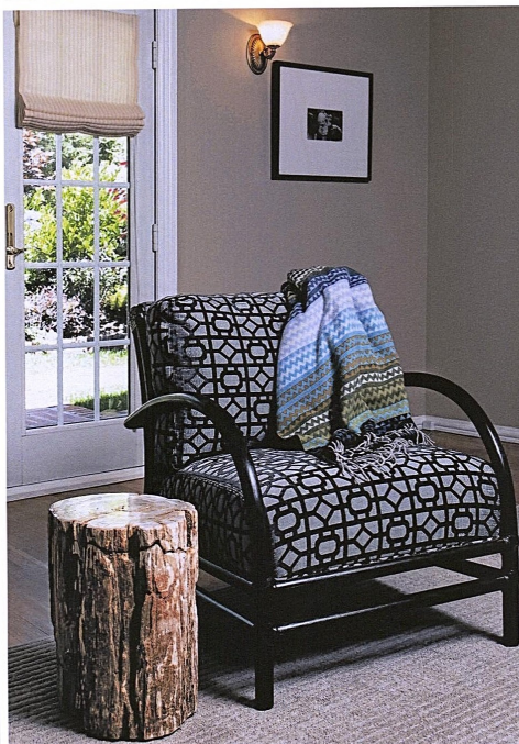
Reclaimed timber serves as a unique table for a drink, remote or laptop.