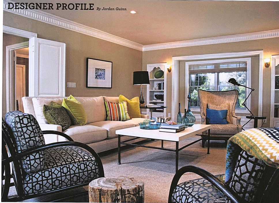
Glass vases, bowls and dishes provide the juxtaposition to wood finishes and decorations in this Crocker Highlands home.